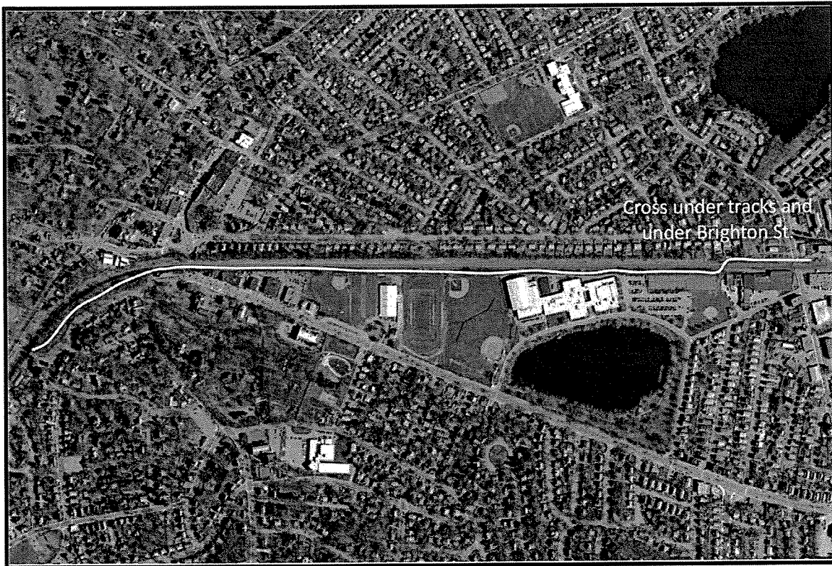
Figure 9-14: Eastern Belmont on South Side of Fitchburg Line.